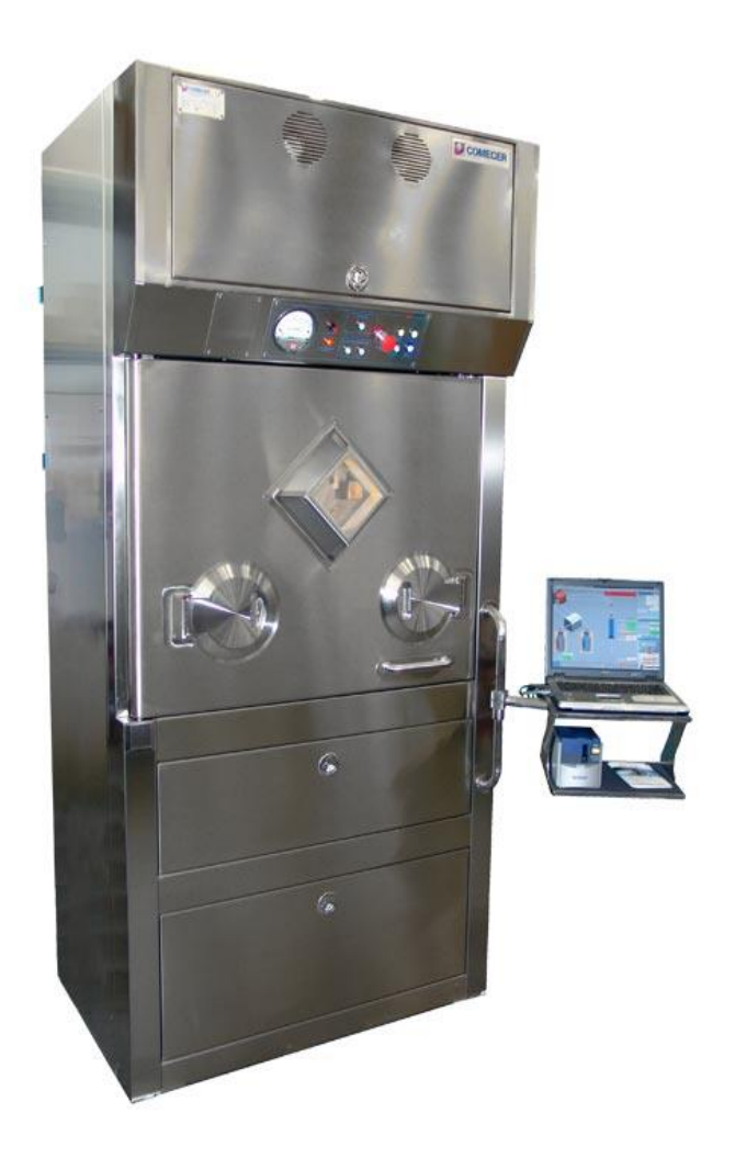
One of the Comecer's machines, using an HMI workstation based on MoviconX

The automation technology adopted by Comecer is based on fieldbus, PLC Siemens